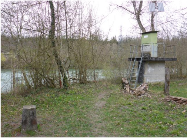
Westernmost point of Switzerland N46° 07.935' E5° 57.383'