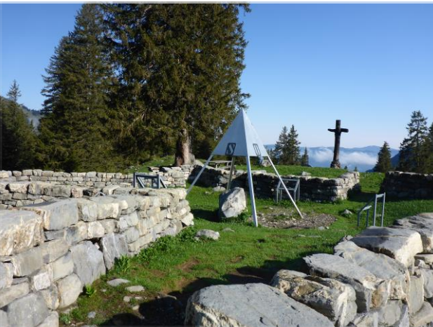
Geographical centre of Switzerland N46° 47.923' E8° 13.908'

On Saturdays, Sundays and public holidays there is one-way traffic on the last 5 km (ascents at even hours, descents at odd hours).