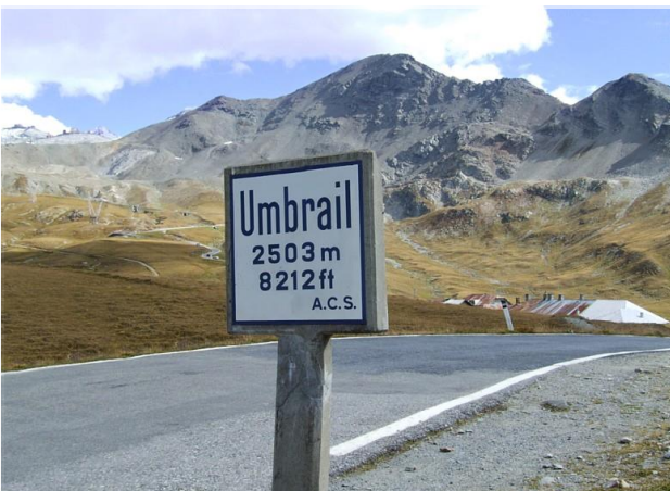
Highest (accessible) point in Switzerland N46° 32.536' E10° 25.990'

On Saturdays, Sundays and public holidays there is one-way traffic on the last 5 km (ascents at even hours, descents at odd hours).